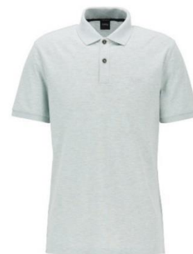
Regular-fit polo shirt in Pima-cotton piqué