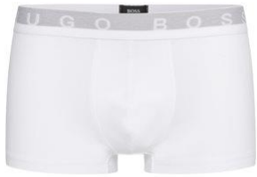
Premium stretch boxer shorts