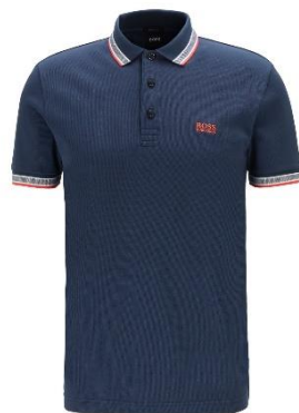
Regular-fit polo shirt in Pima-cotton piqué