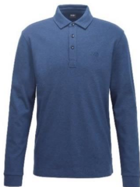
Long-sleeved polo shirt in interlock cotton