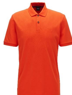
Regular-fit polo shirt in Pima-cotton piqué