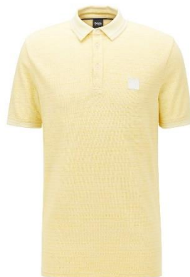
Polo shirt in double-spun two-tone cotton