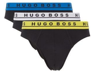
3 pack of logo briefs in stretch cotton