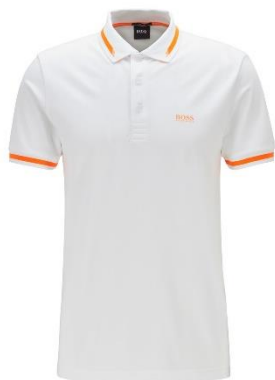
Slim-fit polo shirt with S.Café® and logo collar