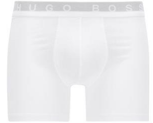
Boxer briefs in stretch cotton