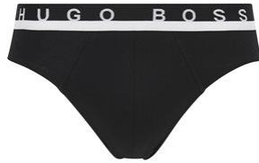
Logo-waistband briefs in stretch cotton