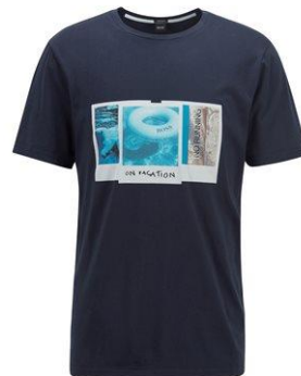
Pima-cotton T-shirt with collection-themed photographic print