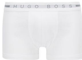
Cotton boxer with logo waistband