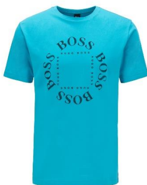
Cotton-jersey T-shirt with new-season logo