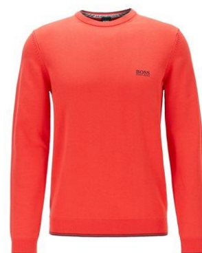
Knitted sweater in cotton-blend stretch yarn