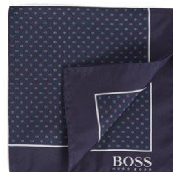
Italian-made silk pocket square