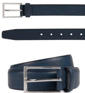
Italian-made belt in vegetable- tanned leather