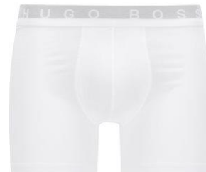
Boxer briefs in stretch cotton