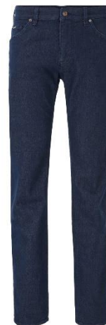
Regular-fit jeans in dark-blue cashmere-touch denim