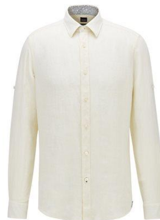
Regular-fit shirt in chambray linen