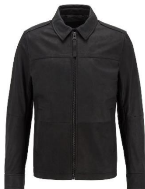
Goat-leather jacket with denim-effect lining