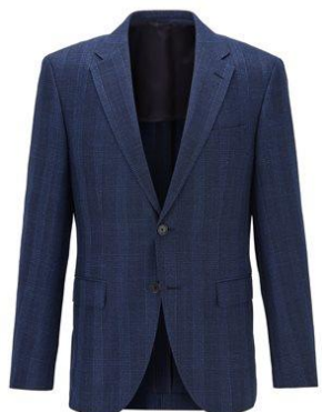
Regular-fit jacket in checked fabric with elbow patches