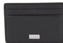
Money clip in soft Italian leather with natural grain