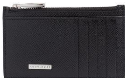
Signature Collection card case in palmellato leather