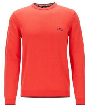
Knitted sweater in cotton-blend stretch yarn