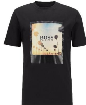
Fully recyclable T-shirt in cotton with summer-themed print