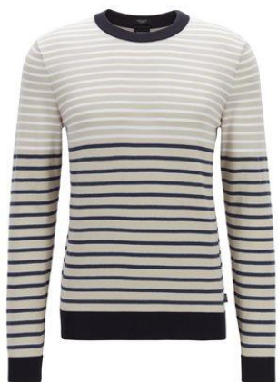
Regular-fit cotton sweater with colour-block stripe