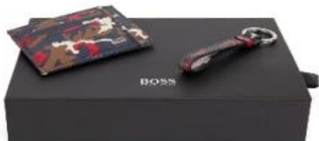
Camouflage-print leather card holder and key ring set