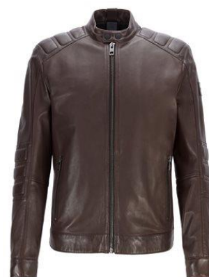
Biker jacket with quilted details at sleeve, back part and shoulder