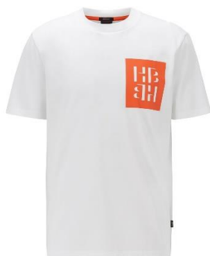
Regular-fit T-shirt in cotton with monogram print