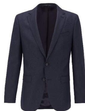
Slim-fit jacket in virgin-wool serge