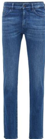
Slim-fit jeans in mid-blue Italian denim