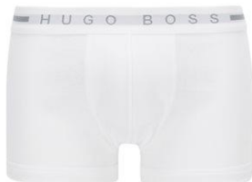
Cotton boxer with logo waistband