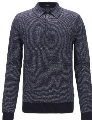
Knitted sweater in cotton and linen with polo collar