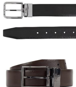
High quality, soft suede cow leather belt (width: 3,5cm)