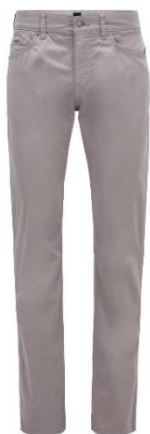
Slim-fit jeans in satin-stretch denim with monogram lining