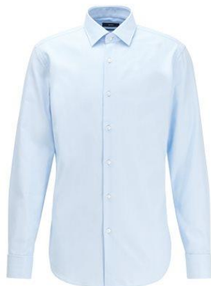
Slim-fit shirt in cotton with double cuffs