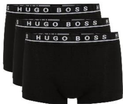
Three-pack of boxer shorts in cotton stretch