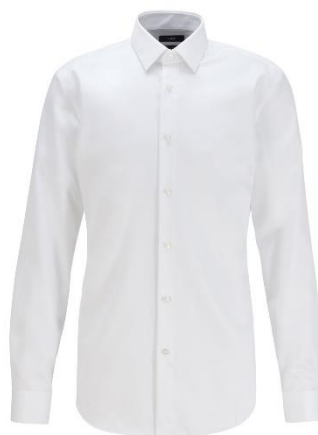
Slim-fit shirt in crease-resistant cotton twill