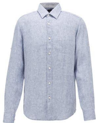
Regular-fit shirt in chambray linen