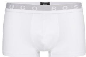
Premium stretch boxer shorts