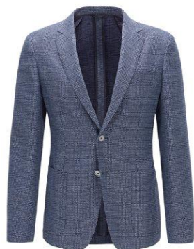
Slim-fit jacket in a patterned virgin-wool blend