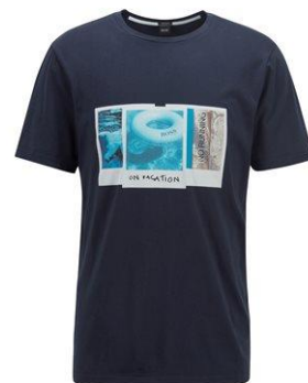
Pima-cotton T-shirt with collection-themed photographic print