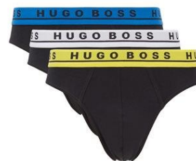
3 pack of logo brifs in stretch cotton