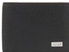
Wallet Soft Italian leather with natural grain