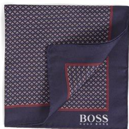
Italian-made silk pocket square