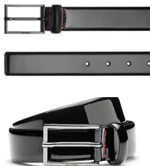
Patent belt with bicolour finishing (width: 3 cm)