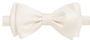
Silk bow tie