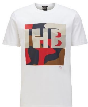
Cotton T-shirt with monogram and camouflage print