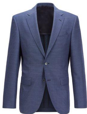
Regular-fit jacket in basket-woven virgin wool with elbow patches