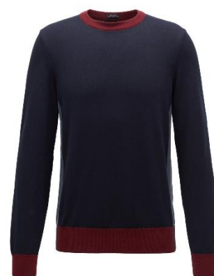
Regular-fit sweater with colour-block hemline