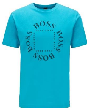
Cotton-jersey T-shirt with new-season logo