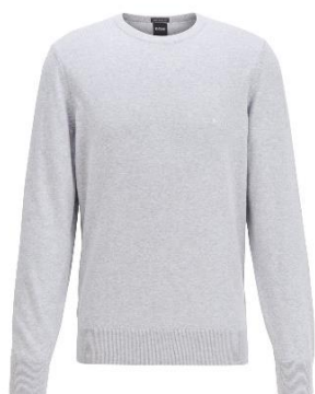
Crew-neck sweater in cotton with chest logo