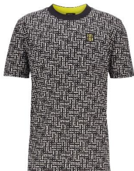
Mercerised-cotton T-shirt in relaxed-fit with monogram print