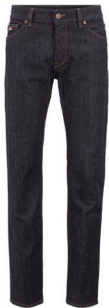
Regular fit jeans in stretch fabric