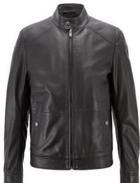
Classic blouson style with detailing