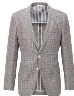
Slim-fit jacket in virgin wool and linen with partial lining in striped fabric