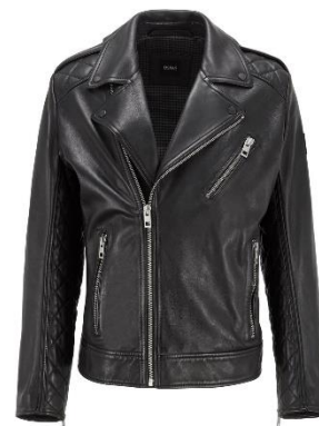
Regular-fit leather jacket with quilted sleeves