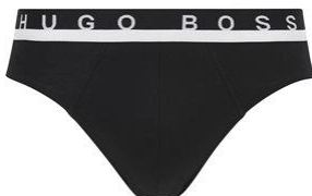
Logo-waistband briefs in stretch cotton