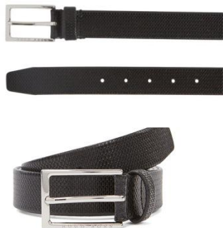
Leather belt with embossed