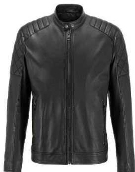
Slim-fit biker jacket in waxed leather