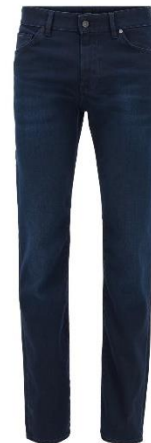
Regular-fit jeans in dark-blue Italian stretch denim