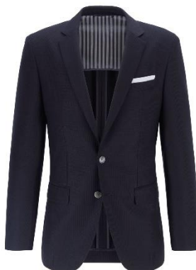
Slim-fit jacket in micro-patterned virgin wool