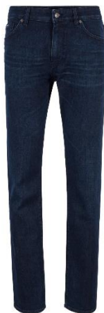
Regular-fit jeans in dark-blue Italian stretch denim