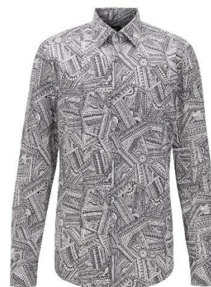
Slim-fit shirt in satin with collection print