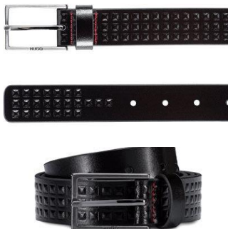
Leather belt with embossed pyramid studs