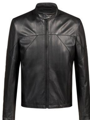
Slim-fit biker jacket in nappa leather