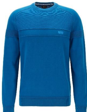
Regular-fit sweater in organic cotton with mesh structure