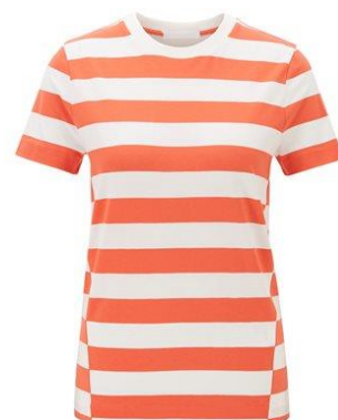
Regular-fit T-shirt with an all-over stripe