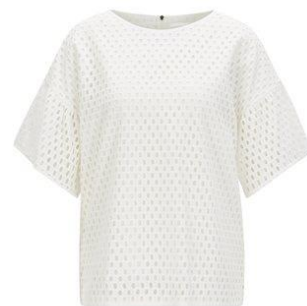
Dropped-shoulder top in cotton broderie anglaise