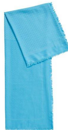
Square scarf in modal and wool with monogram print