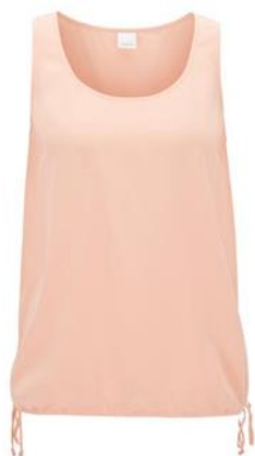
Sleeveless silk top with drawstring hem