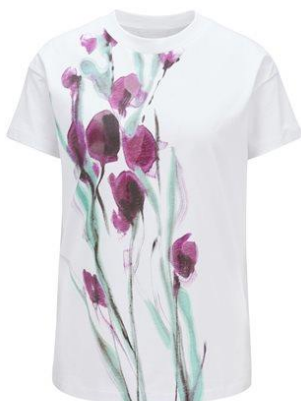
Cotton-jersey top with mixed-print artwork