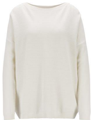
Oversized-fit sweater in cotton, silk and cashmere