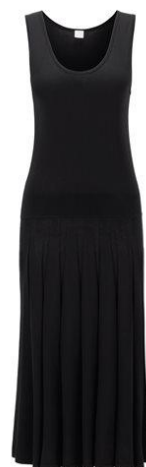
Sleeveless knitted dress with dropped hem in cotton with silk