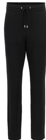
Cropped length Jog pants with elastic drawcord