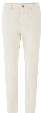
Relaxed-fit cropped chinos in stretch twill