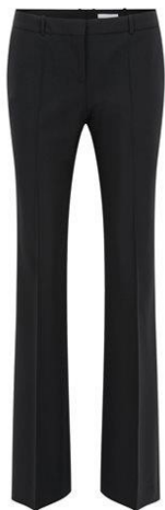
Regular-fit trouser with bootcut leg