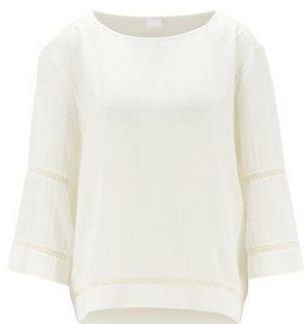
Regular-fit checked top with embroidered trims