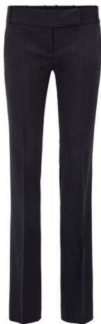
Slim-leg cropped trousers in Portuguese stretch fabric