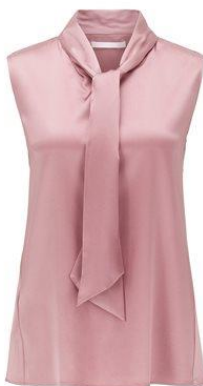
Feminine bow top with slit detail