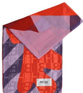
Modal scarf in mixed print