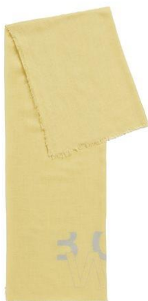
Melange scarf with printed logo