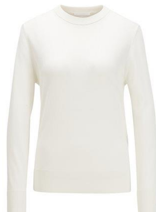
Crew-neck sweater in cotton with silk and cashmere