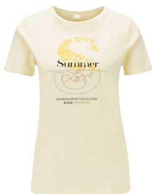
Cotton-jersey T-shirt with mixed-print collection graphic