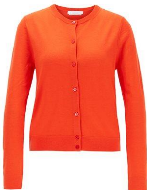
Knitted crew-neck cardigan in virgin wool