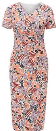
Floral-print jersey dress with asymmetric ruching