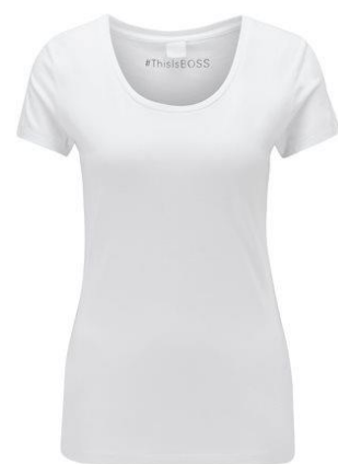
Slim-fit T-shirt in Pima cotton with modal