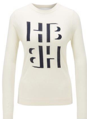
Slim-fit sweater with monogram intarsia in merino wool