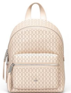
Backpack in HB lasered smooth cow leather (L22 x W13 x H29 in cm)