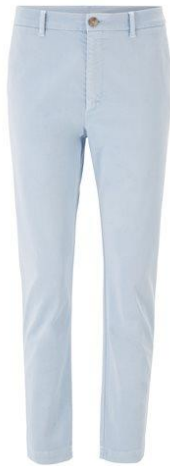
Relaxed-fit cropped chinos in stretch twill