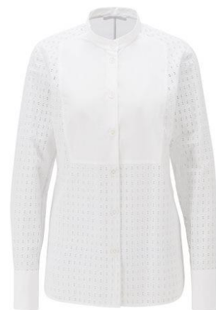
Regular-fit cotton blouse with monogram embroidery