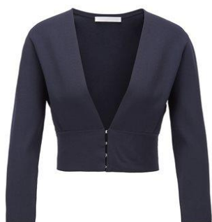
Slim-fit jacket with V neckline and hook closures