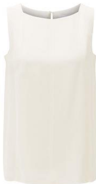
Sleeveless top in silk crepe with pintuck detailing