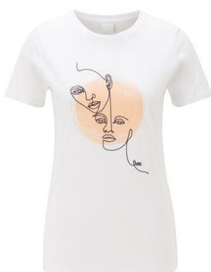
Vasnea-cotton T-shirt with abstract embroidered artwork