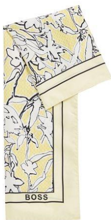
Italian-made square scarf in printed silk twill