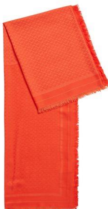
Square scarf in modal and wool with monogram print