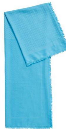
Square scarf in modal and wool with monogram print