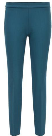
Slim-leg cropped trousers in Portuguese stretch fabric