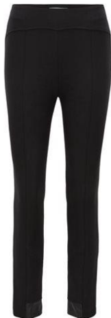
Cropped length skin fitted trouser