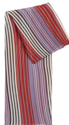
Plissé scarf with multi-coloured stripes