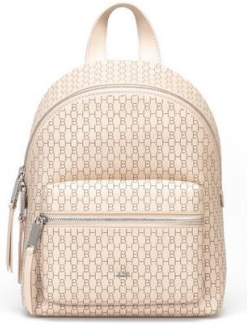
Backpack in HB lasered smooth cow leather (L22 x W13 x H29 in cm)