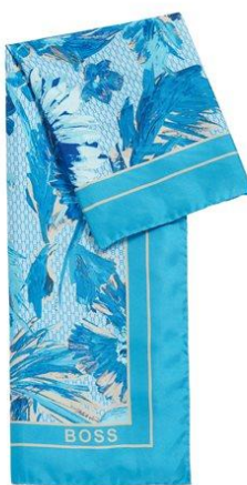
Italian-made square scarf in printed silk twill