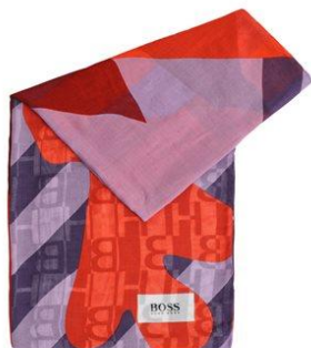
Modal scarf in mixed print