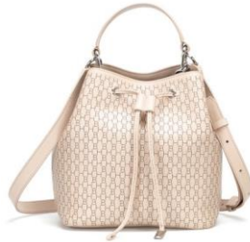
Bucket bag in HB lasered smooth cow (L27 x W18 x H24 in cm)