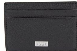
Money clip in soft Italian leather with natural grain