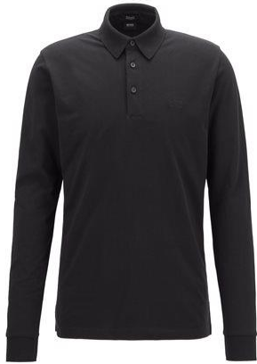
Regular fit long-sleeve polo shirt