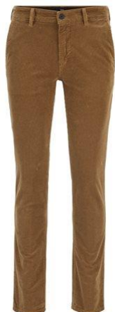
Slim-fit chinos trousers in stretch-cotton corduroy