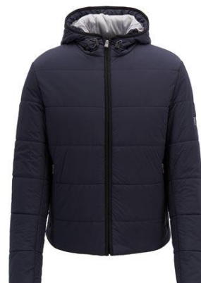
Water repellent hooded outerwear