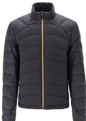
Quilted, water repellent style with reflective details