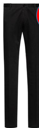
Slim-fit trousers in soft-washed stretch cotton