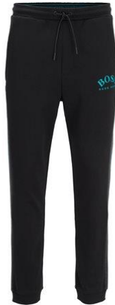
Sweat pant cuffed / combined with combi fabric in contrast and curved logo