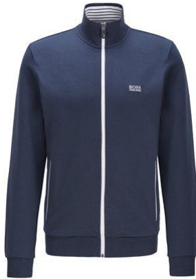
Sweatshirt with zipper and details in contrast