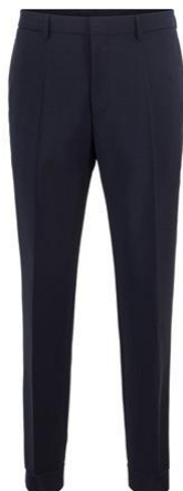
Slim-fit chinos in stretch cotton gabardine