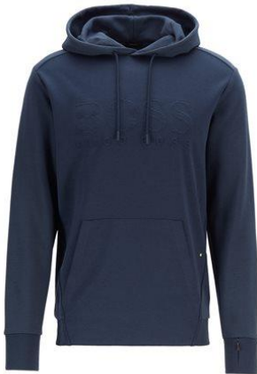
Hooded sweatshirt with tonal embossed logo artwork