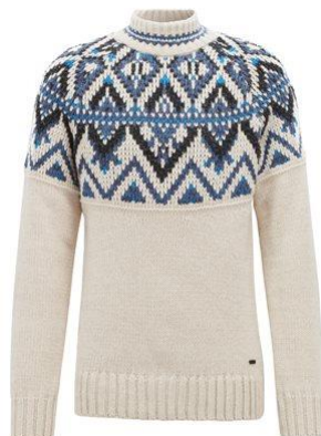
Heavyweight cozy jaquard sweater