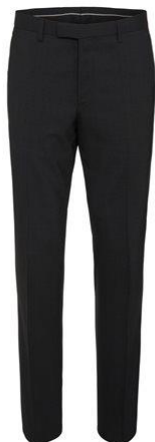
Regular fit trousers in stretch virgin wool