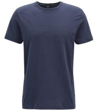
Crew Neck T-Shirt with logo