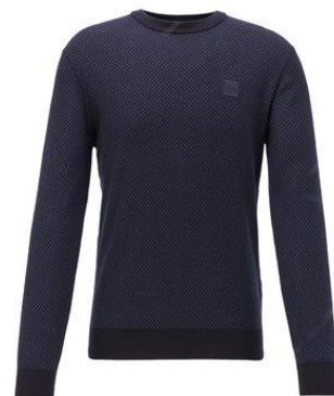
Cotton mix sweater with jaquard structure and chest logo