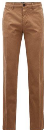
Regular Fit chinos trousers