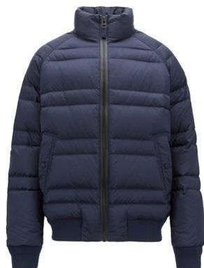
Regular fit bomber jacket in water repellent fabric