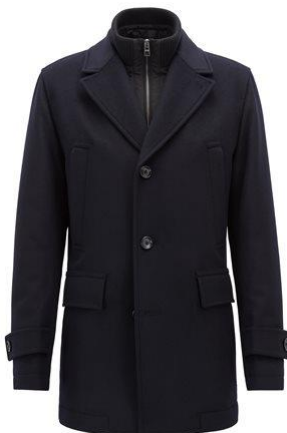
Car coat with quilted lining, detachable bib and knitted collar