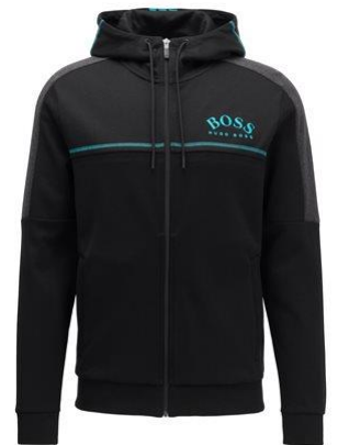
Tracksuit jersey hooded jacket zip