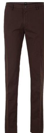
Slim-fit chinos trousers